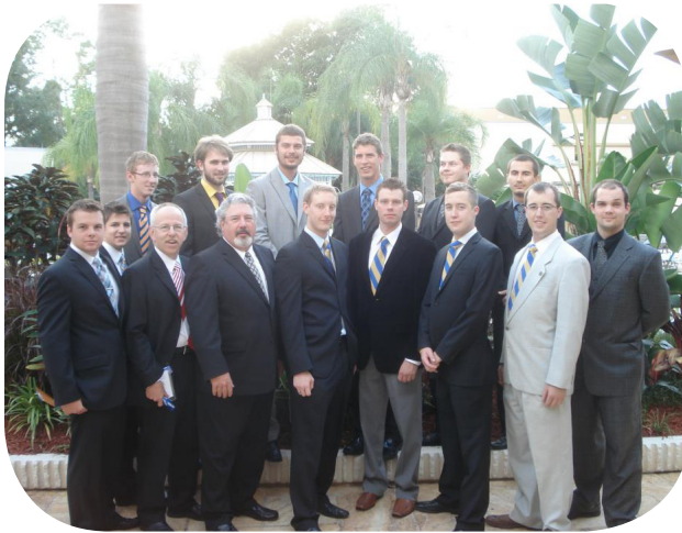
Canadian attendees of the 2011 Leadership Institute