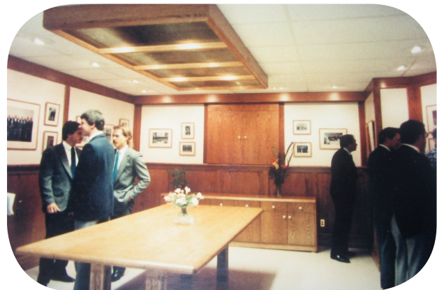
Rutherford's Delta Upsilon Visitor Center opening in 1988